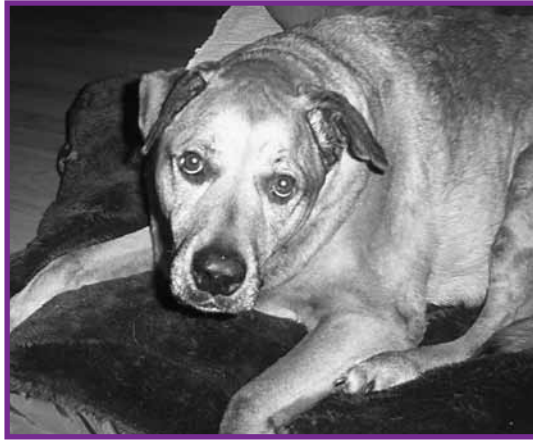
Hopper relaxes at his new home.

Hopper , an eleven-year old Rhodesian Ridgeback, was brought to the Shelter by his person who had lovingly cared for him since he was a puppy. She lost her job and home in Florida, and moved to the Berkshires to seek employment. Months later, she had to accept a one-way ticket back to Florida from a family member, but could not bring Hopper with her. Times had been tough for Hopper even before that. He had developed several open sores, an eye infection and he was so overweight that his back legs could barely hold him up.