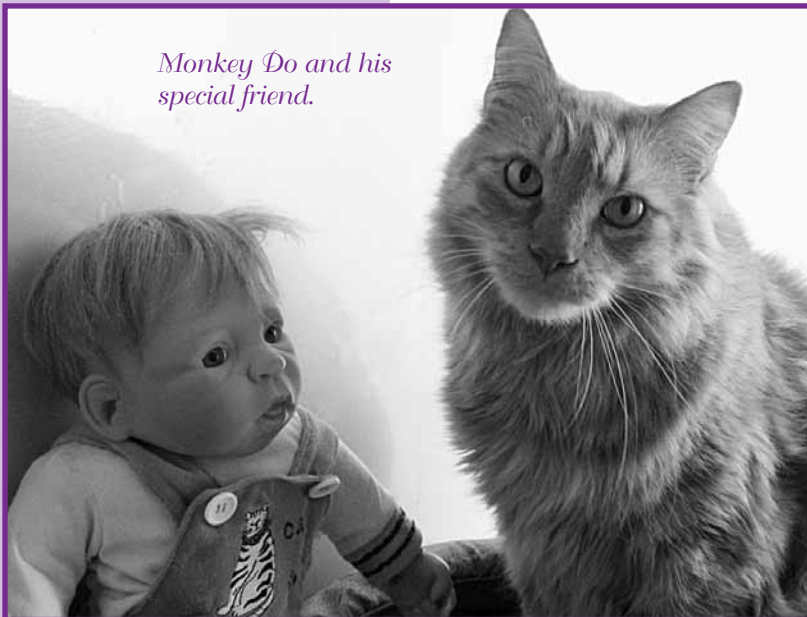
Monkey Do and his special friend.