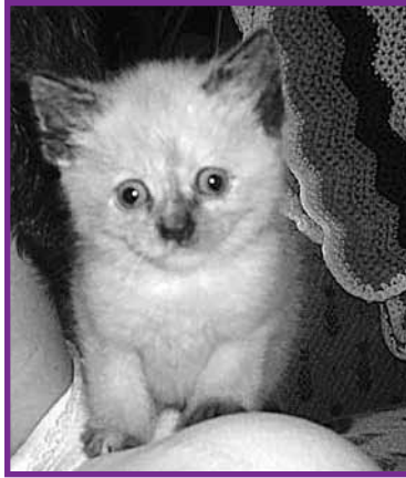
After a rough start to life, this little one now has a loving new home.

Last January, a skittish black cat was noticed wandering around Vicon, Pittsfield's waste facility. Vicon's manager would catch glimpses of her, but couldn't get close. Then, on Valentines Day, he found the cat amidst the garbage along with nine tiny kittens. He scooped up the mamma cat and her eight surviving kittens and called the Sonsini Shelter.